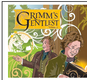
Grimm's Gentlest, Volume 2