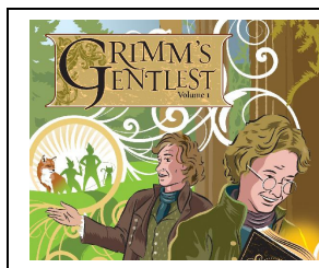
Grimm's Gentlest, Volume 1

Visit our website to listen to audio clips from each of the stories!